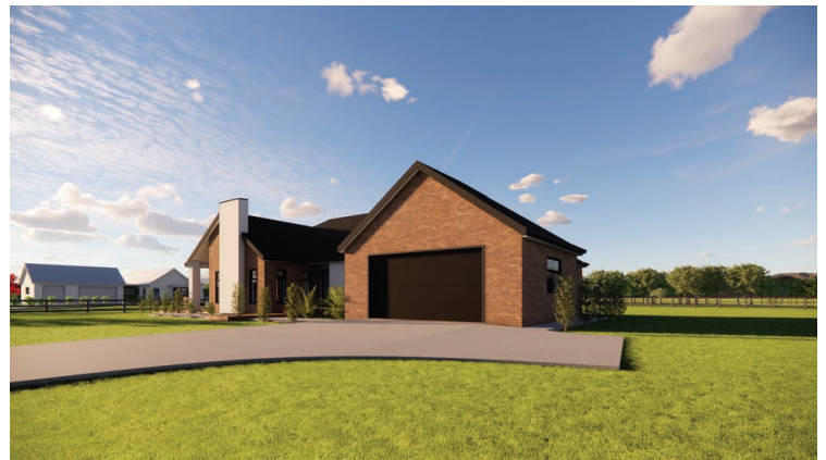
Artists impression only - T&C apply

Whether you simply seek inspiration for your own custom design journey or prefer a complete ready-to-build package, we offer a range of thoughtfully crafted design concepts for each McFarlane Estate section.